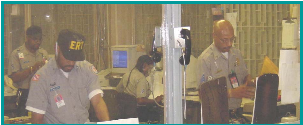
Corrections Officers in the Central Detention Facility Command Center.

DC Dept. of Corrections Office of Communications Grimke Headquarters 1923 Vermont Ave., N.W. Washington, DC 20001 202-671-2135