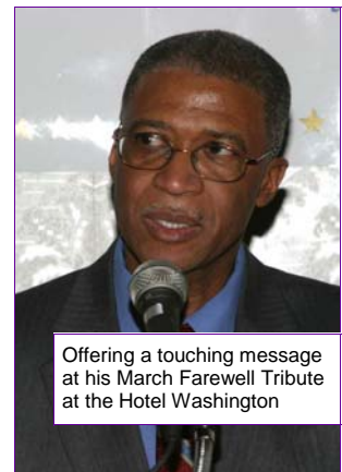
Offering a touching message at his March Farewell Tribute at the Hotel Washington

the past six years. I am truly grateful for your dedication, your support, and the contributions that you have made toward establishing a new DC Department of Corrections. Your efforts are deeply appreciated.”