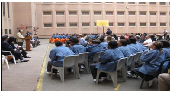
RSAT graduates represent the third class since the program’s inception last year.

Sixty inmates were selected to participate in a special ceremony entitled, “Celebration of Connections,” in recognition of the significant progress made during the last two years within the area of inmate healthcare. The forum showcased the myriad of services that DOC offers to its offender population including an onsite residential substance abuse treatment program (RSAT) for male and female inmates. Twenty-six inmates attending the program were recent graduates of the program, representing the third graduation class since its inception last year. The Department’s Residential Substance Abuse Treatment Program contributed to the District earning a “B+” on Applesseed’s fourth “report card.”