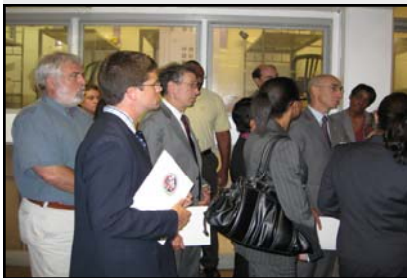
Judges observe jail operations during tour of the facility on October 10.

Members of the District's judiciary commented that the Department of Corrections is a best kept secret as they recently toured the DC Jail. Six Superior Court Judges and their clerks recently visited the jail to