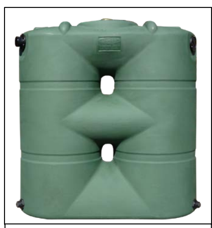
Manufacturer: Bushman Model: Slimline Rain Tank Volume: 265 gallons Dimensions: 64" x 59" x 25" Website: www.bushmanusa.com