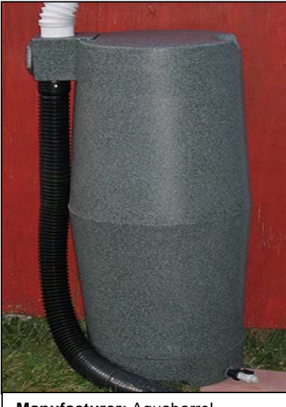
Manufacturer: Aquabarrel Model: Aquabarrel Abe Volume: 80 gallons Dimensions: 52" x 28" Website: www.aquabarrel.com