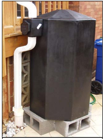
Manufacturer: RainGrid Model: RiverSides Rain Barrel Volume: 132 gallons Dimensions: 51" x 27" Website: www.raingrid.com

There are many rain barrels on the market, but not all of them are well designed. The following barrels are eligible for the rain barrel rebate. These barrels are usually carried at local hardware stores or can be ordered online (websites are listed). Your options are not limited to these examples, but the barrel you select does need to meet all required criteria outlined on page 2.