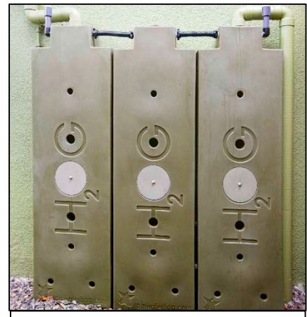
Manufacturer: Rainwater HOG Model: Rainwater HOG Volume: 51 gallons Dimensions: 71" x 20" x 9.5" Website: www.rainwaterhog.com