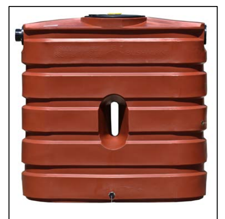
Manufacturer: Bushman Model: Slimline Rain Tank Volume: 130 gallons Dimensions: 50" x 49" x 17" Website: www.bushmanusa.com

Manufacturer: StormWorks Model: Hydra Volume: 116 gallons Dimensions: 54" x 47.81" x 18.3" Website: www.stormworkspgh.com